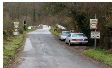
These are the lights from the Hay-on-Wye end

We know it sounds obvious BUT when the lights are red please WAIT – the Bridge is only one way and so if you cross the red light it can cause chaos!