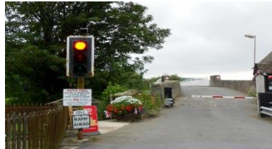
These are the lights at the Hereford end

At both ends of The Bridge (Hereford end and Hay-on-Wye end) there are traffic lights